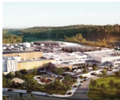
Artist impression of Westfield Coomera