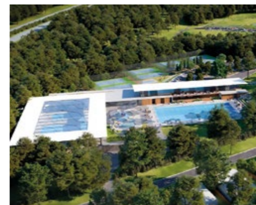
An artist's impression of the $56.5 million Northern Gold Coast Sports Precinct to start construction in 2018.