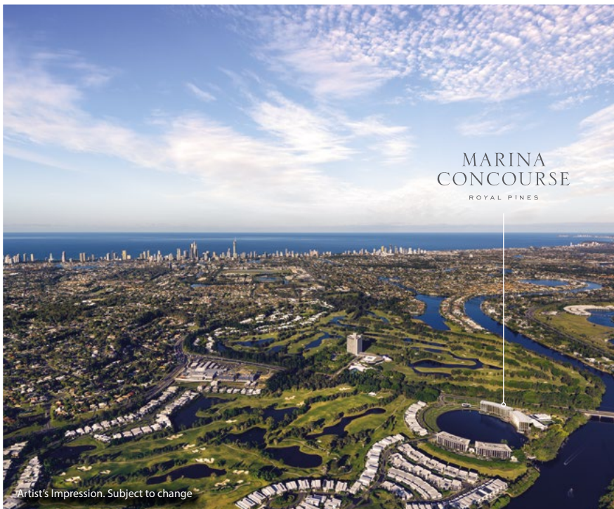
Artist's Impression. Subject to change

The body corporate levies at Marina Concourse will equate to approximately $79 per week. Council rates and water usage are anticipated to be approximately $2400 per annum.