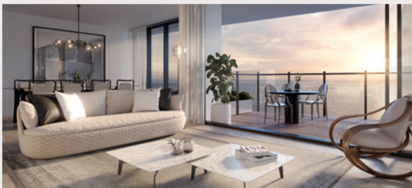
ARTIST IMPRESSION, INDICATIVE ONLY. TIMBER BALCONIES PROVIDED TO PENTHOUSE APARTMENTS ONLY, REFER TO INDIVIDUAL FLOOR PLANS FOR FINISHES.

The striking landscaped façades of the twin mid-rise apartment buildings at Magnoli Apartments creates the effect of a cascading urban garden. This intimate connection to the natural environment is further entwined through generous landscaped setbacks and the creation of a large community parkland. Private resident amenities include a resort-style pool, lounge, and landscaped gardens and entertaining areas. The six architectural homes, located within the precinct, also enjoy access to all exclusive resident amenities, including secure basement parking.