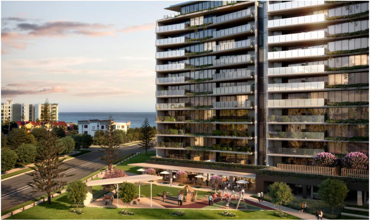
ARTIST IMPRESSION - INDICATIVE ONLY

Sunland Group is proud to present Magnoli Apartments – a collection of boutique residential apartments and architecturally designed terrace homes, only metres from the pristine coastline of Palm Beach.