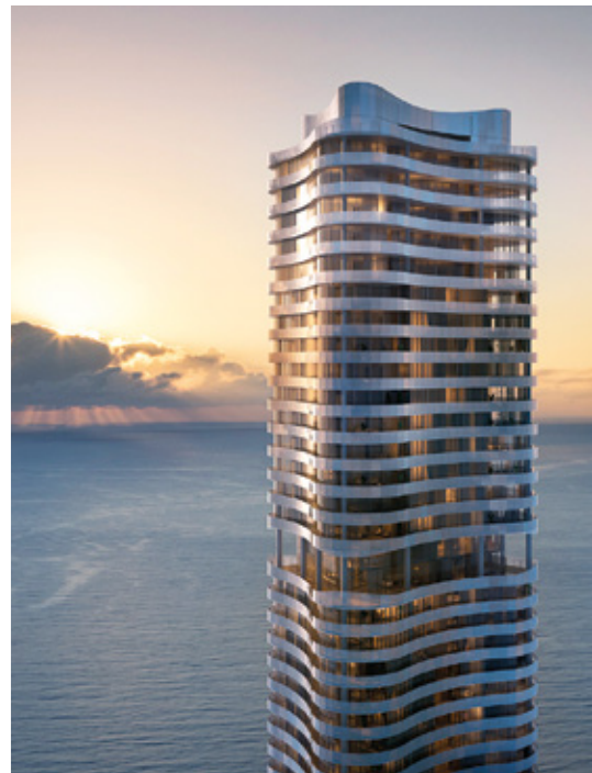
ARTIST IMPRESSION - SUBJECT TO CHANGE

272 Hedges Avenue will feature unparalleled resident amenities, including a dedicated concierge service, swimming pool, spa, gym, sauna, steam room, and treatment room.