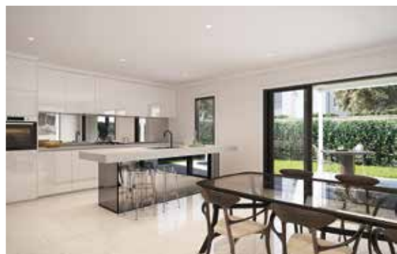
ARTIST IMPRESSION, INDICATIVE ONLY.

Montaine Residences is a master planned community of large three and four-bedroom plus study duplexes and terrace homes featuring beautiful, mature landscaping and expansive green spaces. Each double-storey home is fully fenced and landscaped and features open plan living and dining spaces, premium kitchen complete with high-gloss cabinetry and quality appliances, two bathrooms, and guest powder room. Ducted air conditioning is provided to the living area and all bedrooms. The homes have been carefully designed to maximise the natural light and breezes with large windows and glass sliding doors integrating the indoor and outdoor living areas. More than one third of the 5.5-hectare community is dedicated to open green space and landscaping.