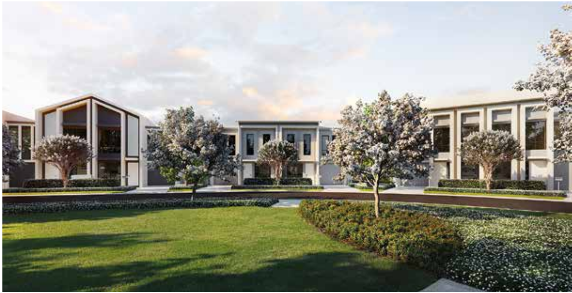
ARTIST IMPRESSION, INDICATIVE ONLY.

Montaine Residences presents a vibrant new neighbourhood, within the established suburb of Mount Annan in Sydney's growing South-West, located on the doorstep of leading retail and lifestyle amenity.